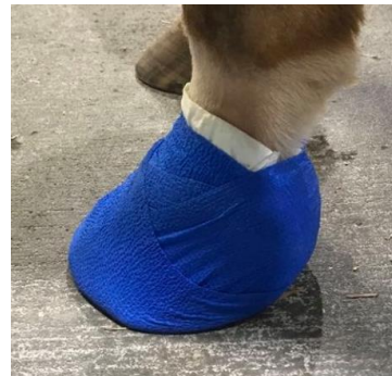
A completed layer of Vet Wrap.