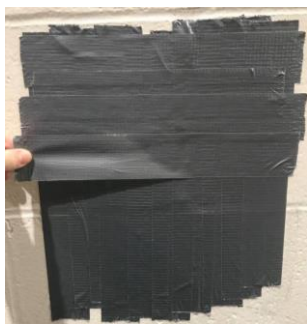
First lay strips of duct tape vertically. Then lay strips of duct tape horizontally.

The next layer of the hoof bandage is a duct tape boot. This layer helps to keep the bandage clean and dry. To make the duct tape bandage, use a flat surface to stick strips of duct tape to. First begin by laying the strips vertically, overlapping each strip by about 50%. Then lay strips horizontally over the vertical strips, again overlapping by about 50%. The size of the square needed will vary based on your horse's hoof size, but it should be large enough to cover the sole of the foot and extend up the sides of the hoof. To aid in application of the duct tape boot, cut diagonal lines in the corners of duct tape square. To apply the boot, place the center of the square over the hoof. To secure the duct tap to the bandage, fold the edges of the boot around the hoof starting with the back edge of the boot, then the front edge, then the sides.