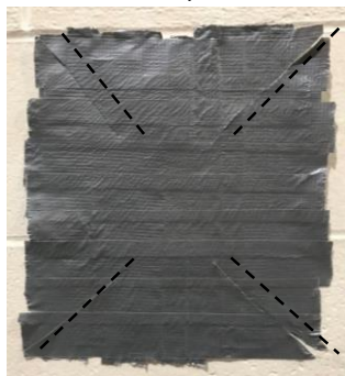
A completed duct tape square. The lines indicate where to cut to help the boot stay secure on the hoof.