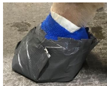
A completed duct tape boot.