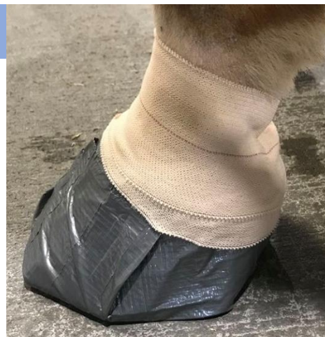
A completed bandage.

This layer should not be applied under tension.