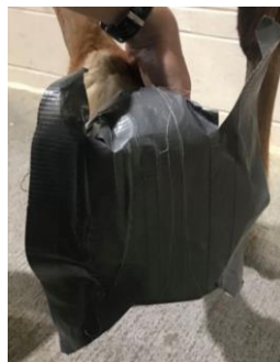
Lay the duct tape over the bottom of the hoof. Then fold the tabs at the back and front of the hoof over followed by the sides.