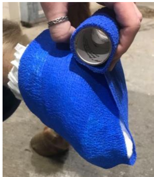
Wrap the Vet Wrap over the walls and sole of the hoof. A figure eight pattern can be helpful to cover the hoof.

Next, Vet Wrap will be used to help keep the bandage in place. Holding the roll in a way that it easily unrolls, wrap the Vet Wrap over the diaper. This wrap can be difficult to get in place due to the shape of the hoof. One method to wrap is a Figure Eight pattern. After wrapping around the hoof wall bring the wrap over one heel bulb, across the bottom of the hoof to the opposite side of hoof. Next, bring the wrap over the toe to the opposite side of the hoof and across the bottom of the hoof to the opposite heel bulb. It may take several wraps to cover the diaper completely. This wrap should be tight enough to hold the bandage in place but not too tight, especially around the coronary band (where the hoof wall and hair meet). Try to avoid letting the Vet Wrap extend off the diaper onto the horse's leg.