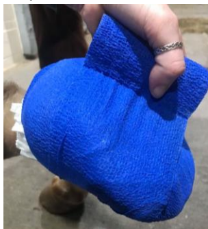
The Vet Wrap should completely cover the diaper. Note that the roll is held in a way that unrolls easily.